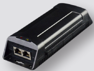
POE-INJ01S PoE Single Port Passive Injector – 30W