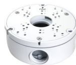
0070-11813 Junction Box