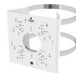
0070-11851 Pole Mount