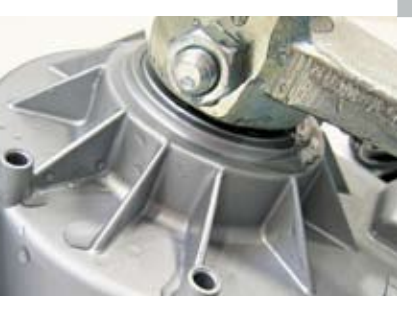
Total water-tightness Frog's high quality standards and its IP67 protection standards from external agents keeps it always in perfect working order.

Frog is Came's highly efficient operator that defies time thanks to the materials used in the foundation case and the gearmotor. A smooth, safe movement guaranteed in all working conditions, even the harshest, but which, above all needs no periodic maintenance.